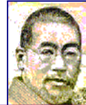
Dr. Mikao Usui Rediscovered Reiki in the mid-1800s